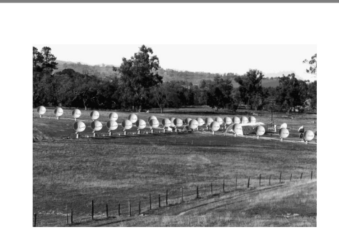
Bracewell Spectroheliograph at Stanford

which visitors will be able to determine the location of a number of cosmic radio sources by measuring the sun's shadow, an outreach education program will be established whose goals are to bring the wonders of science to inspire, excite, and educate students of all ages at NRAO's Very Large Array (VLA) Site.