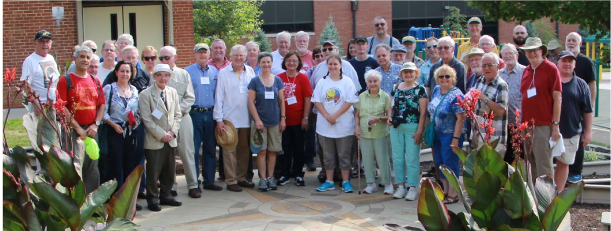
Delegates pictured at the Analemmatic Sundial, Long Elementary School