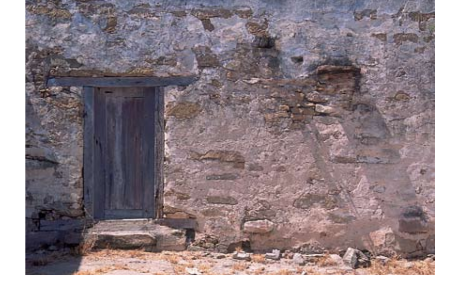
(previous page) interior courtyard of the Jesus Trevino Fort (left) mesquite doorway to cuarto viejo (below) stuccoed walls of the casa larga

smooth white plaster with the rough-cut sandstone. At the base of the walls, historic sidewalks composed of enormous blocks of sandstone dragged from the riverbanks were carefully repaired. As a unit, this ensemble of buildings presents itself as a warm and inviting oasis that offers a welcome refuge from the harsh climate of the borderlands. By 1990, Tracy made the compound the headquarters of the River Pierce Foundation, which is dedicated to the preservation of the natural and cultural environment of the border.