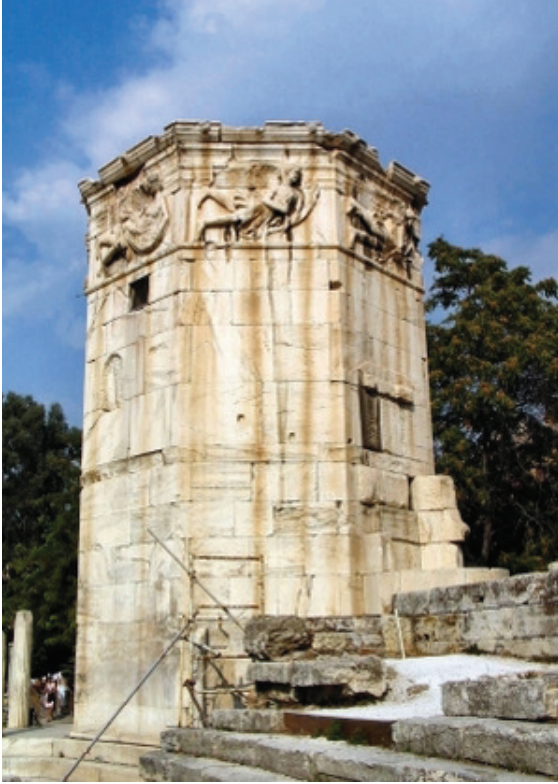
Fig. 1c The Tower of the Winds