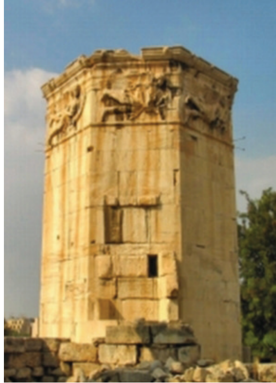
Fig. 1d The Tower of the Winds