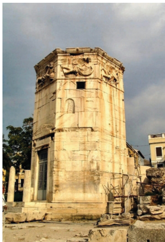
Fig. 1b The Tower of the Winds