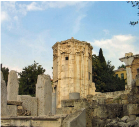
Fig. 1e The Tower of the Winds