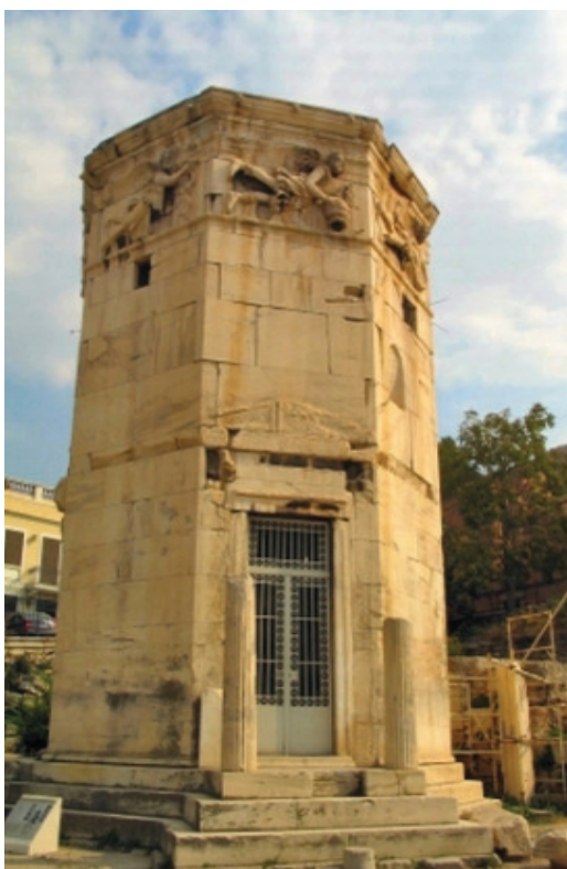
Fig. 1a The Tower of the Winds

The Roman Agora , also known as Forum or marketplace, lies east of the ancient Greek Agora of Athens. It has actually little relation to the Romans, beyond the fact that it took its name because it was built during the height of Roman Empire (1st Century C.E.) in order to serve the growing population of Athens. Its plan was simple but highly functional: a large space surrounded by a rectangular colonnade with the shops arranged behind it. The whole complex has external dimensions 111 by 98 m, while the dimensions of the central space in Roman times were 82 by 57 m. Among the Roman Forum's well-known buildings were the Agoranomeion for the market authorities, the Portico, and the Gate of Athena Archegetis (The Leader). However, the most important and famous building inside the Forum is the hydraulic clock tower of Andronicus Kýrrhestos. It is better known as the Tower of the Winds (modern Athenians refer to it as Aerides ) due to the personified depictions of the eight winds (blowing from the eight principal directions) and their names, which decorate the top of its sides (Figures 1a, b, c, d, e).