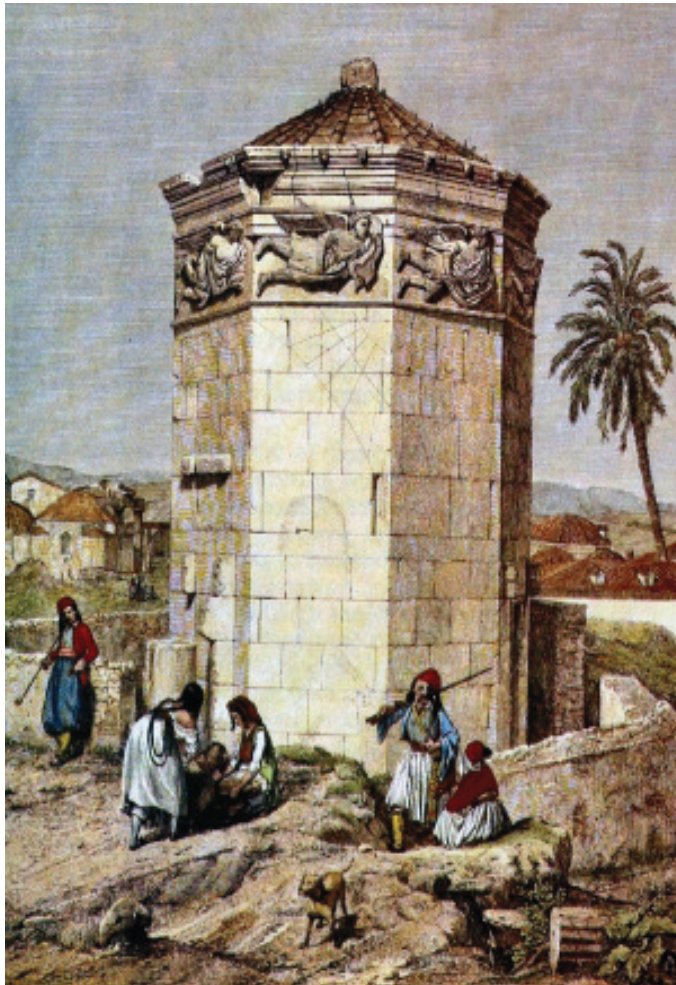
Fig. 4 Copper engraving by Andrea Gasparini (1843)